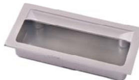
PS-4003 ZINC CONSIL DRAWER HANDLE