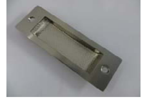
622 ZINC CONSIL SLIDING HANDLE