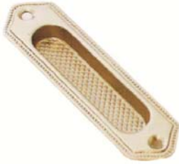
5235 ZINC CONSIL SLIDING HANDLE