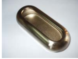
603 ZINC CONSIL SLIDING HANDLE