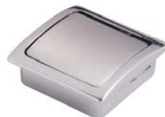
PS-4008 ZINC CONSIL PULL HANDLE