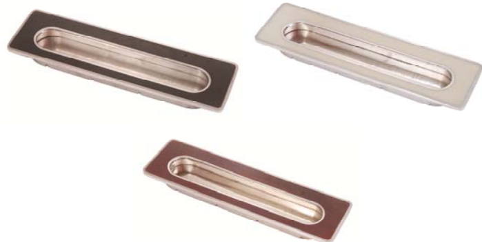
9189 ZINC CONSIL SLIDING HANDLE