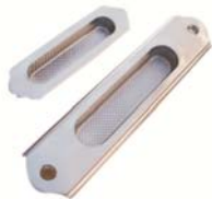
PS-4002 ZINC CONSIL SLIDING