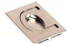
4013 ZINC CONSIL PULL HANDLE