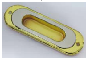
PS-4007 ZINC CONSIL SLIDING HANDLE