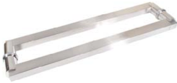
PPH-1022 (PULL HANDLE)