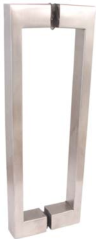
PPH-1014 (PULL HANDLE) 304 SS (I)