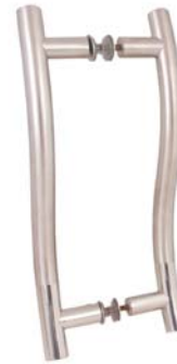
PPH-1026 PULL HANDLE