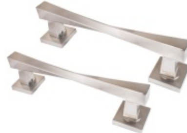
PMH-005 MAIN DOOR HANDLE