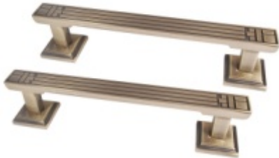
PMH-001 MAIN DOOR HANDLE