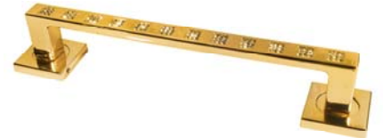
PM-047 MAIN DOOR HANDLE

Finish : gold Material : ZINC Size : 300 MM Weight : 800 gram per pcs