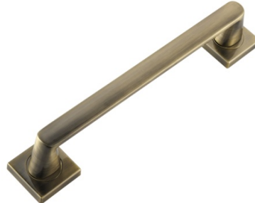
PMH-055 Main Door Handle