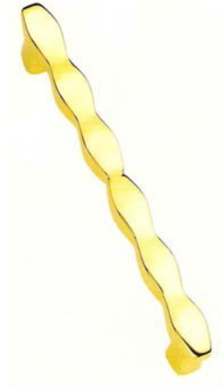
PMD-025 ( MADE IN ITALY - BRASS )