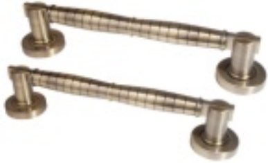
PMH-004 MAIN DOOR HANDLE