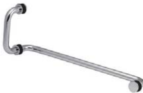
PPH-1027 (PULL HANDLE) SS-304