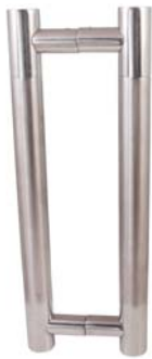
PPH-1011 (I) ( GLASS DOOR HANDLE)