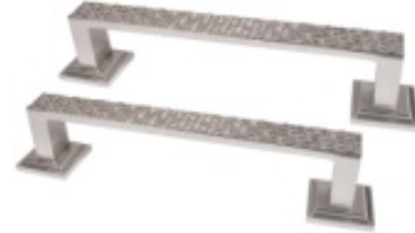
PMH-002 MAIN DOOR HANDLE