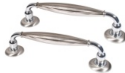
PMH-008 MAIN DOOR HANDLE