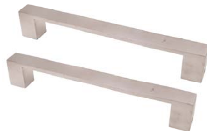
PPH- 1017-304 (PULL HANDLE)