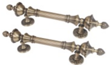
PMH-006 MAIN DOOR HANDLE